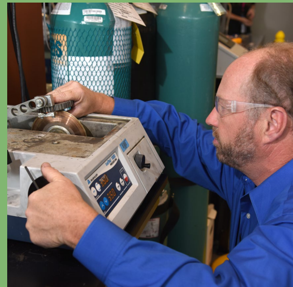
A researcher uses a medium speed sectioning saw to prepare a sample.